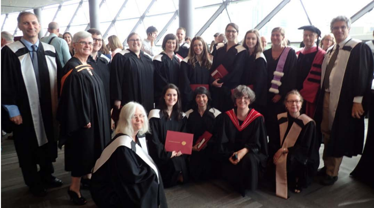
Convocation, June 2017