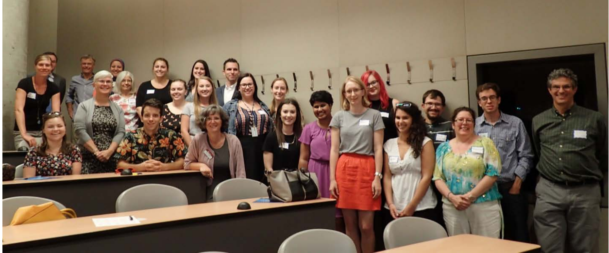
Orientation session, September 2016