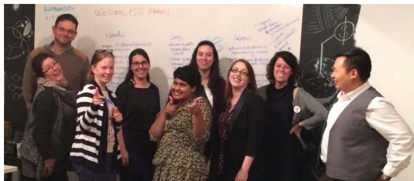
Alumni organizing event, November 2016

An ÉSIS alumni organizing event was held at HUB Ottawa on November 3, 2016, with approximately twenty-five alumni in attendance. Topics discussed in a brainstorming session included the potential involvement of alumni in a mentorship program for current ÉSIS students, connecting prospective students with alumni, and increasing alumni engagement in the development of the MIS program.